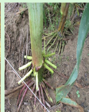
Brace Roots of Corn